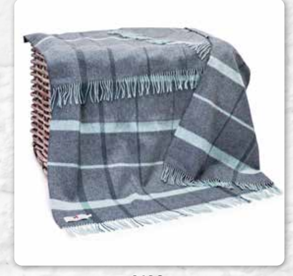
3129 Grey Duck Egg Check