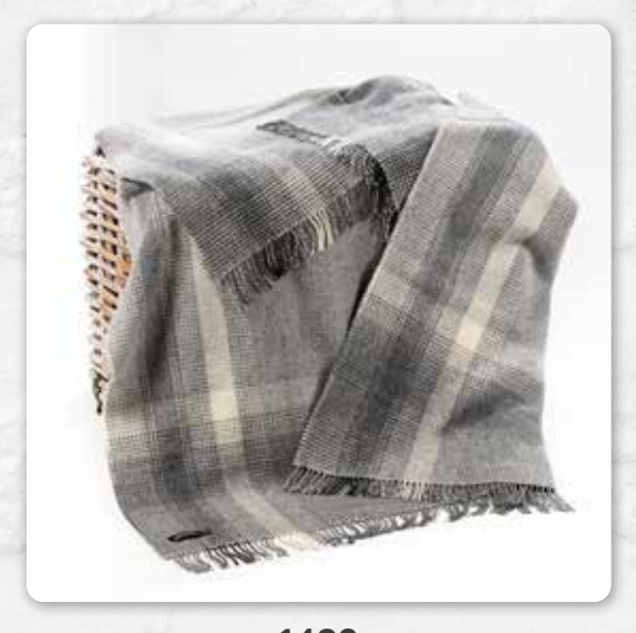
1489 Grey Silver Border Check