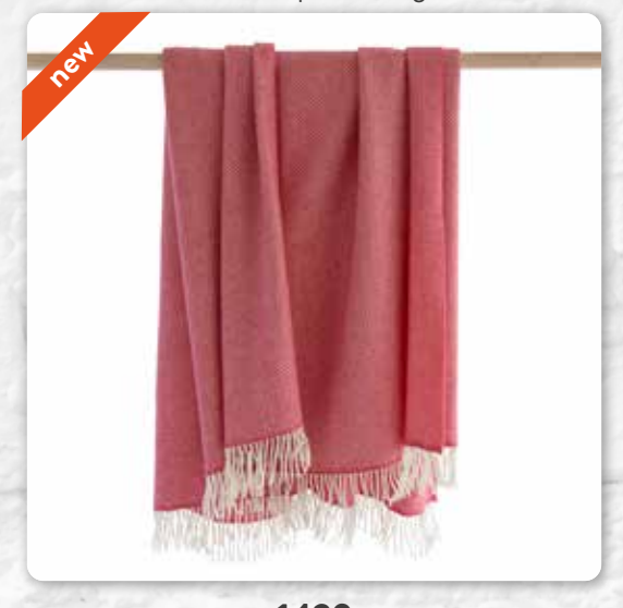
1439 Dusty Pink Bubblegum Herringbone