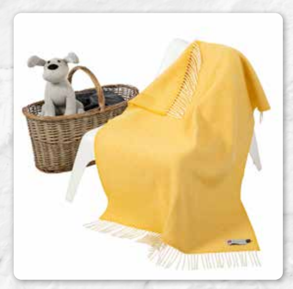
BB18 Baby Yellow