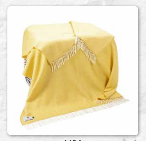
1424 Yellow Herringbone