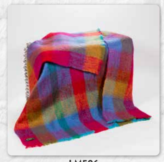
LM596 Bright Pink Mustard Purple and Aqua Block Check