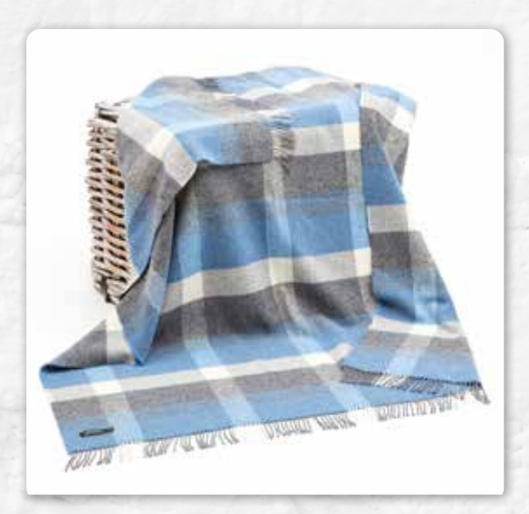
1414 Denim Cream and Pale Grey Check