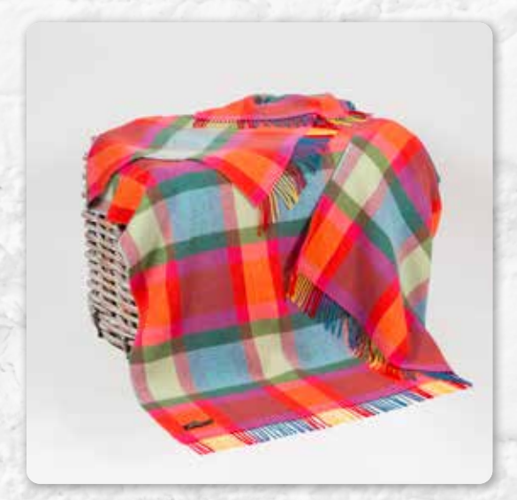
1418 Bright Yellow Pink Blue and Green Check