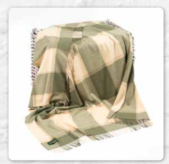
647 Green and Cream Check