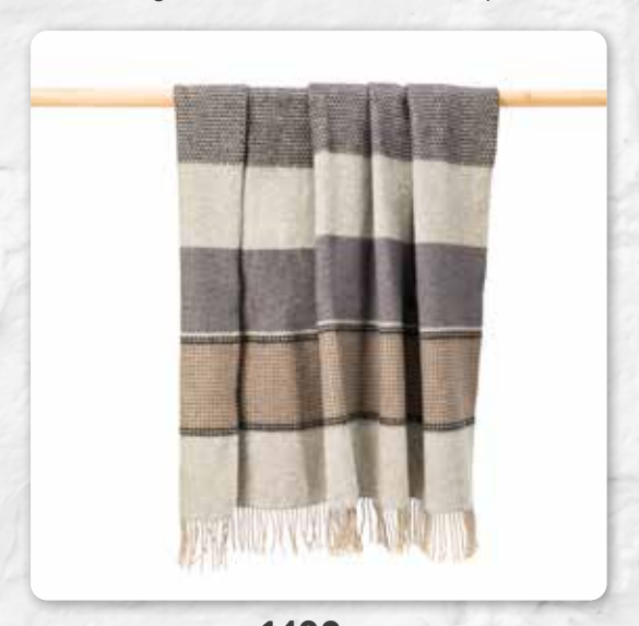
1490 Grey Stone Beige Stripe