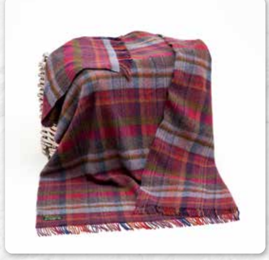
LW134 Raspberry Navy Orange and Pink Plaid