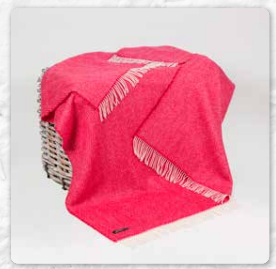
1406 Raspberry Herringbone