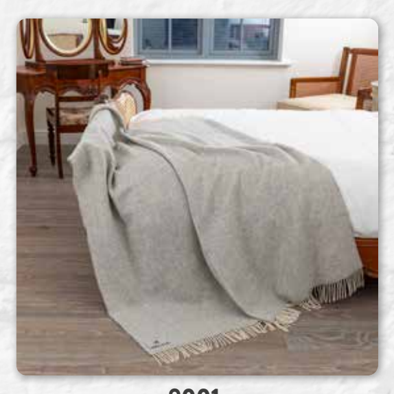
9001 Pale Grey Cream Herringbone