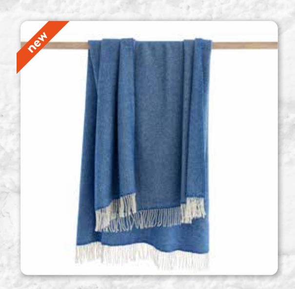
1434 Sea Blues Herringbone