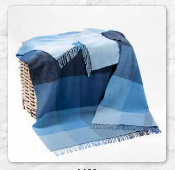
1422 Blue Mix Herringbone Block