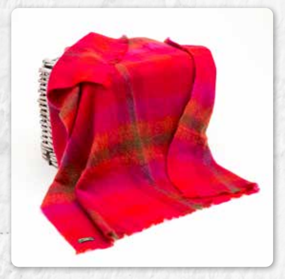
LM552 Bright Red and Pink Check