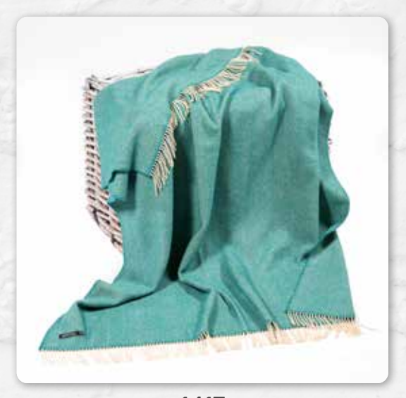
1417 Green Aqua Herringbone