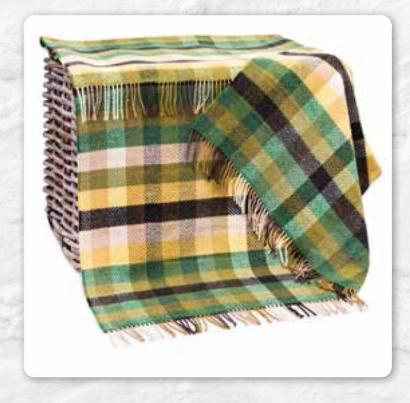
1405 Green Yellow Charcoal Diamond Weave