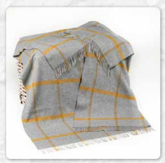
3136 Grey Mustard Check