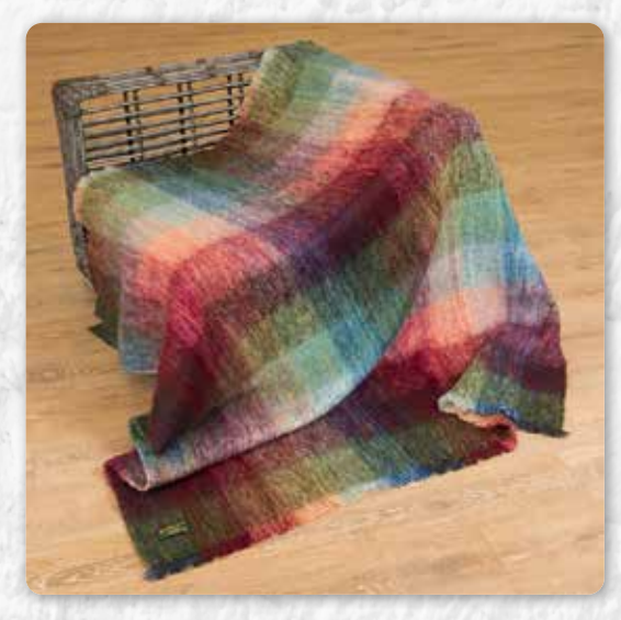
LM502 Watercolour Monet

70% Mohair, 30% Wool - 137 x 182cms (54" x 72")