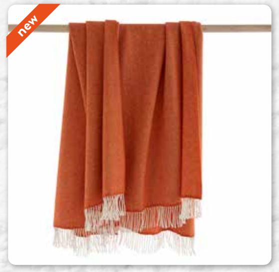
1437 Orange Bronze Herringbone