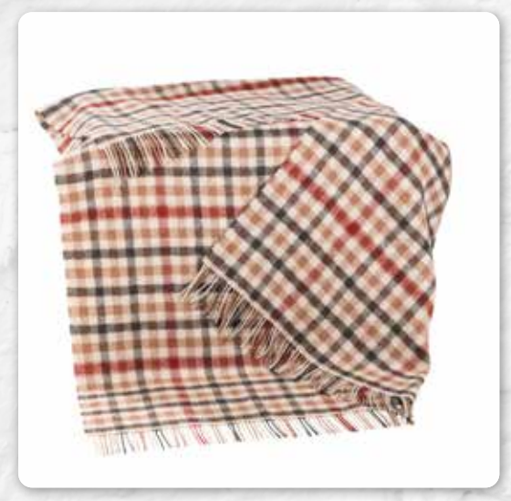
LW115 Beige Rust Red Small Block