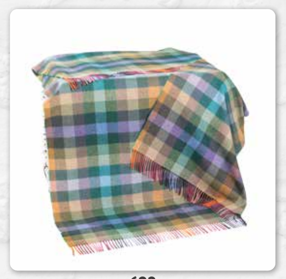
623 Navy Grey Blue Check