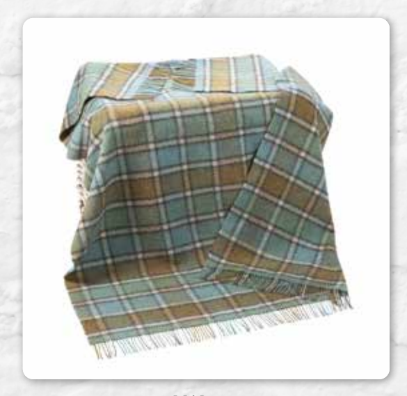
LW120 Lichen Sea Green and Beige Plaid