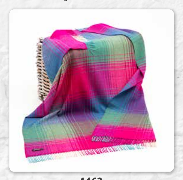
1463 Red Green Denim Herringbone