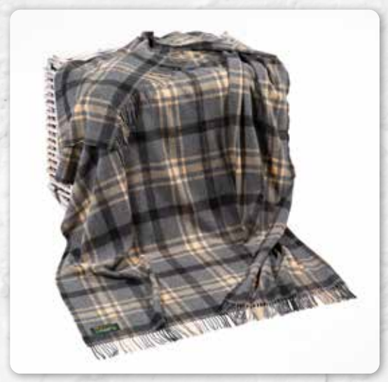
661 Grey Beige Check