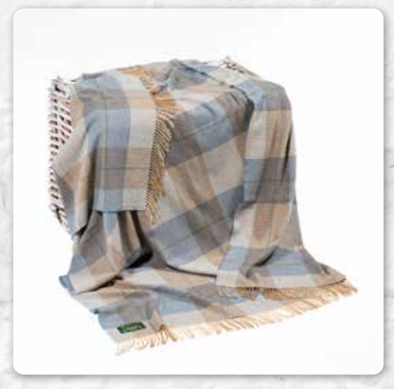
616 Cream Taupe and Denim Check