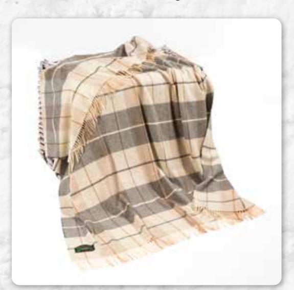
629 Cream and Brown Tartan Mix