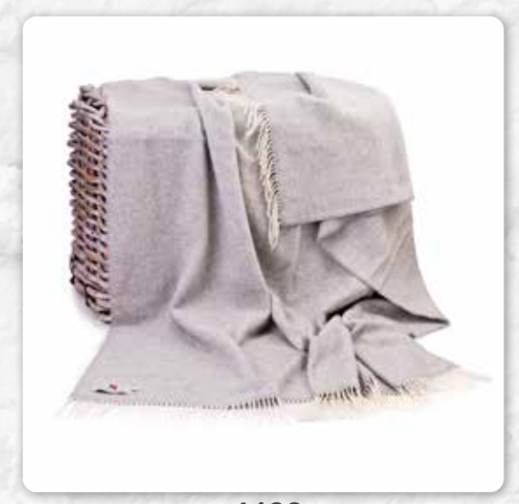
1488 Pale Grey Cream Herringbone