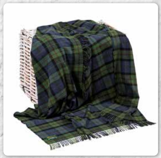
625 Denim Green Plaid