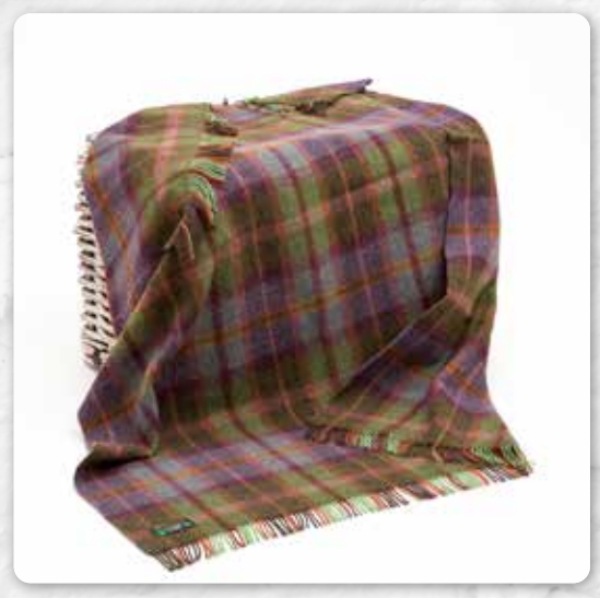
LW187 Green and Purple Mix Plaid