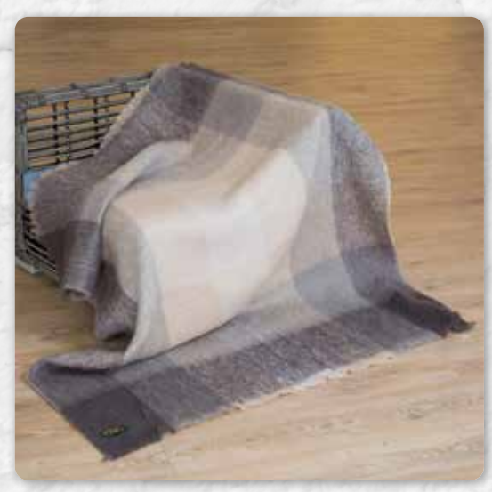
LM517 Beige Grey Large Block

70% Mohair, 30% Wool - 137 x 182cms (54" x 72")