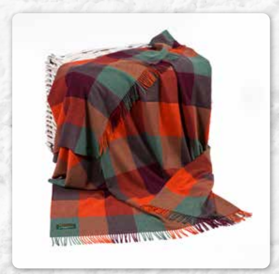
642 Orange Maroon Sea Green Block