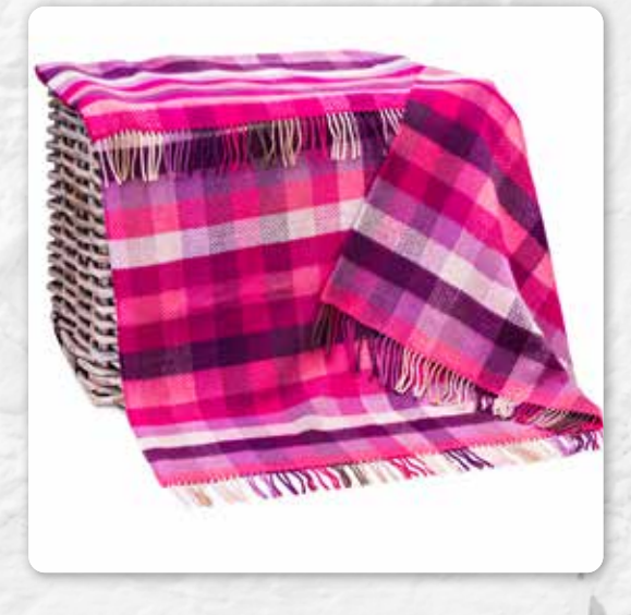
1409 Pink Mauve Purple Diamond Weave