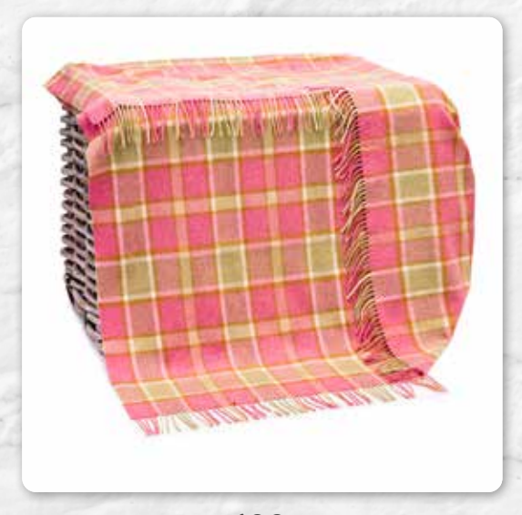
600 Pink Sage Check