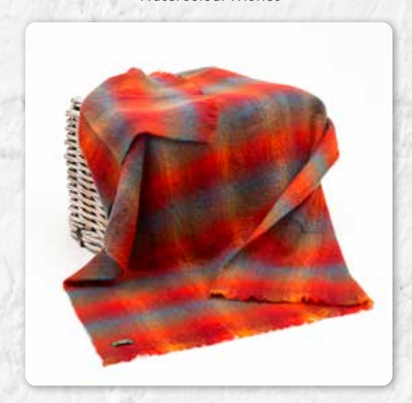
LM556 Bright Orange Red and Blue Check