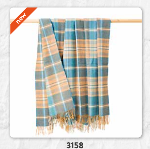
Blue Orange Plaid