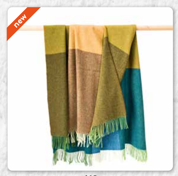
Blue Green Mustard Tan Large Blocks