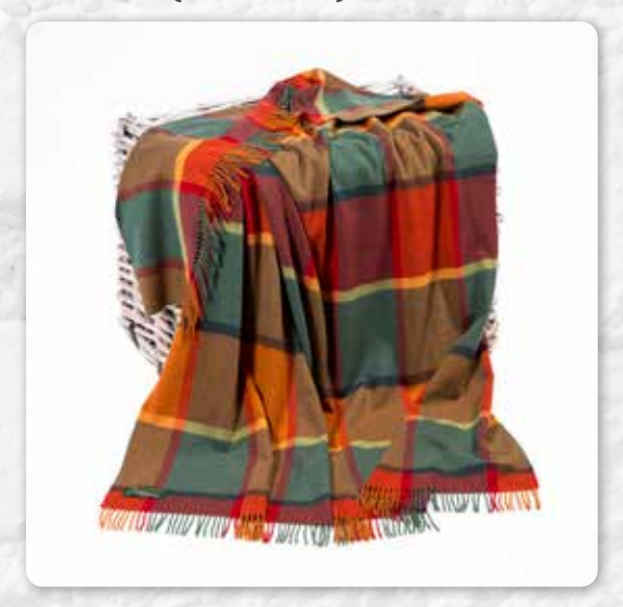
639 Orange Green Yellow and Wine Check