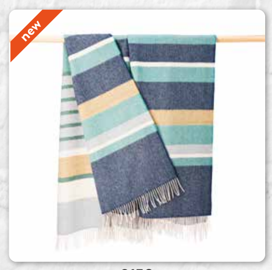
3159 Blue Stripe