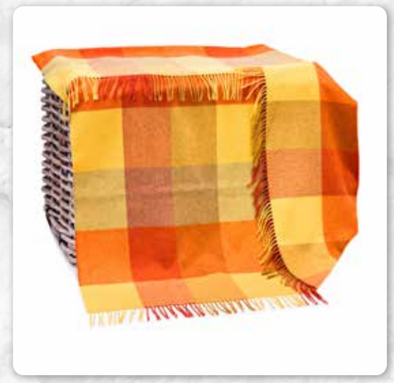
648 Yellow Orange Block Check