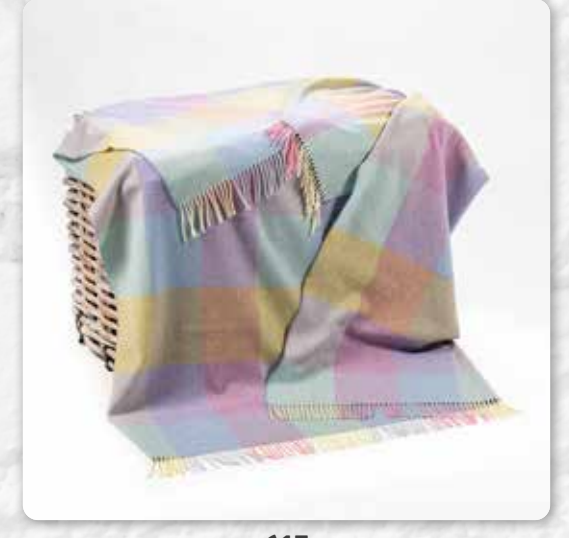
615 Pink Blue Yellow Lilac Block Check