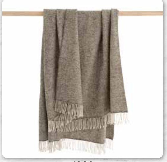
Grey Mix Herringbone