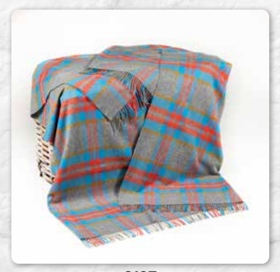
3137 Grey Aqua Orange Mustard Check