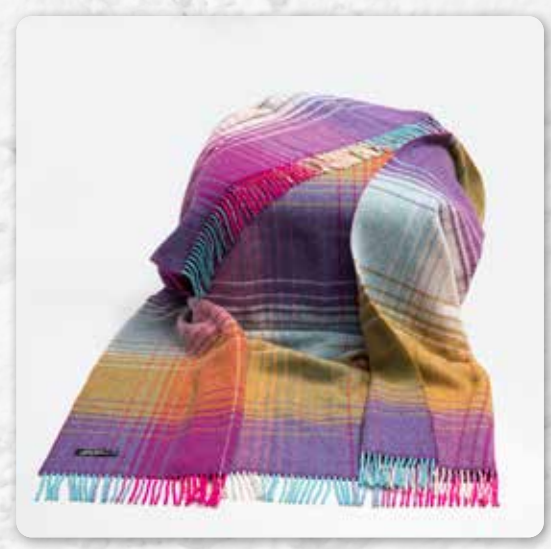
1464 Pink, Purple & Mustard Check