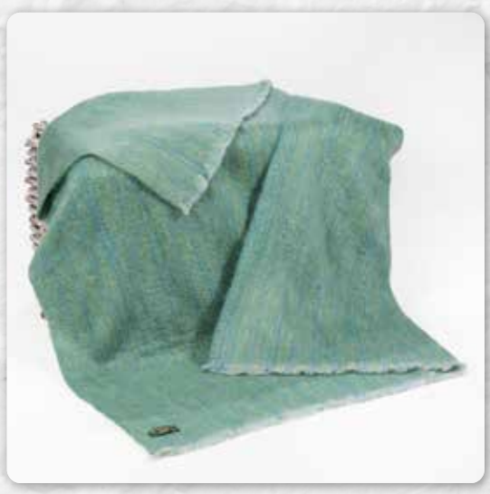
LM521 Pale Green and Blue Plain