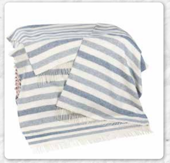
3146 White with Denim Stripe