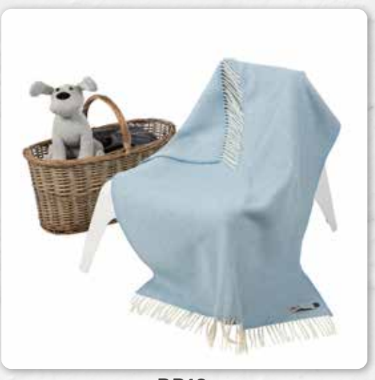
BB19 Baby Blue