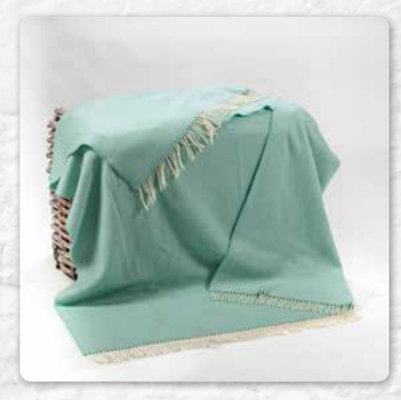
1419 White Mint Herringbone