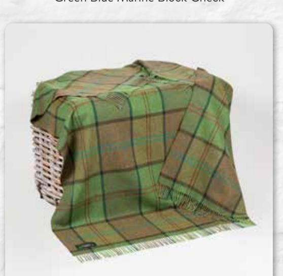
618 Green Earthy Check