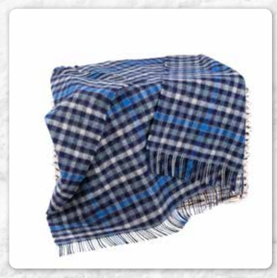
LW109 Blue Small Block Check