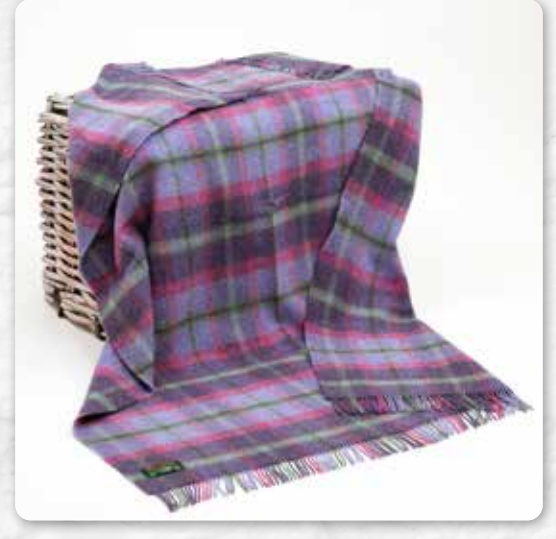
LW188 Purple Pink and Green Plaid