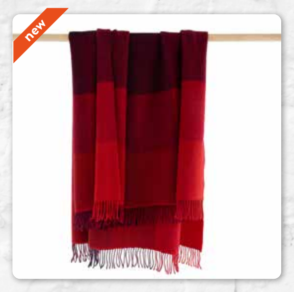
1441 Red Wine Burgundy Blocks