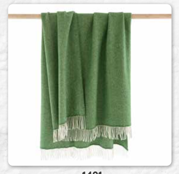
1491 Green Herringbone