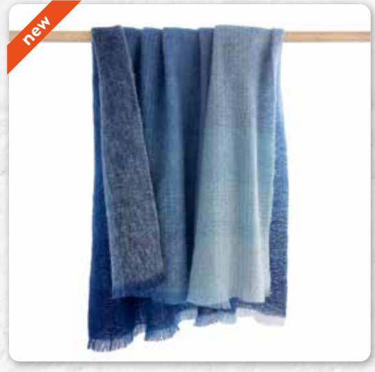
LM505 Multi Col Blues