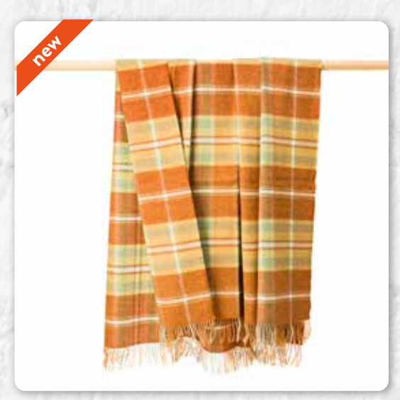
3157 Orange Rust Plaid