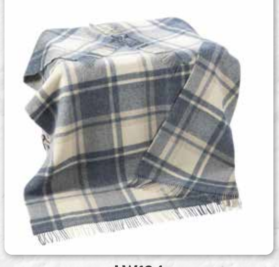
LW124 Natural Denim Blue Mix Plaid