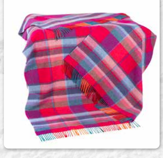
1472 Orange Cerise Mulit Check