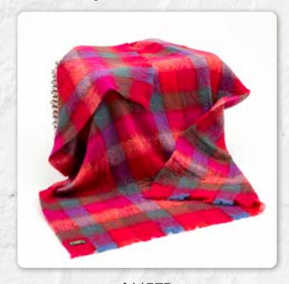
LM575 Red Pink Block