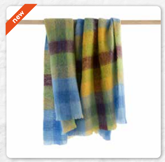
LM506 Blue Yellow Lime Brown Blocks