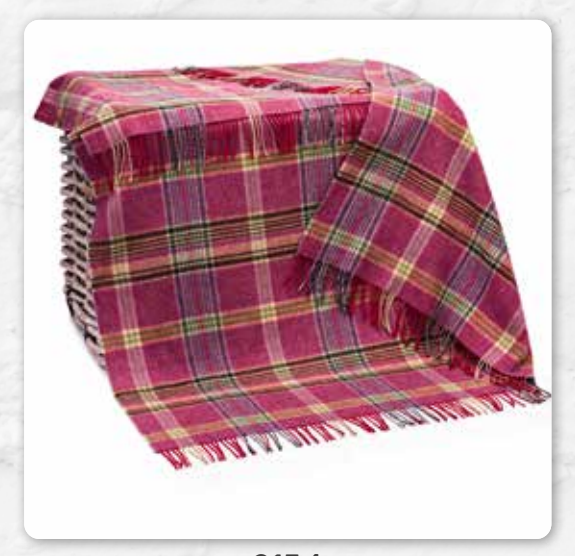
3154 Pink Lilac Glencheck