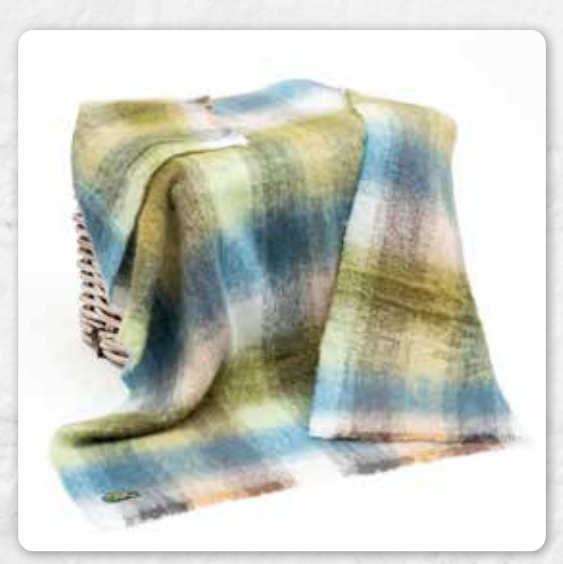
LM510 Cream, Pale Blue, Pale Green & Grey Mix Block Check