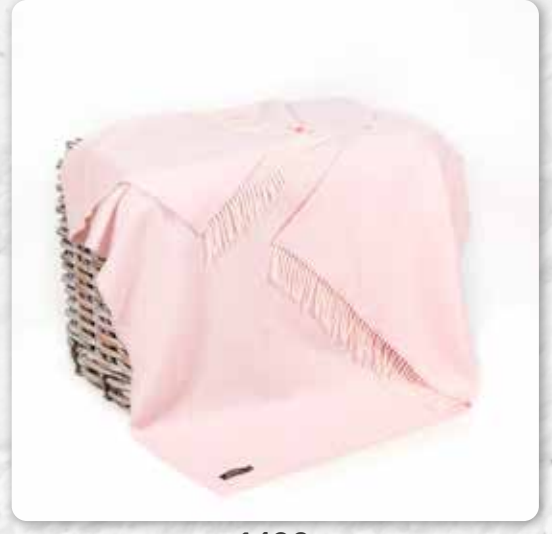
1430 Baby Pink Herringbone