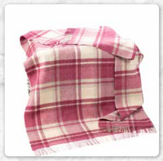
LW126 Natural Pink Mix Plaid