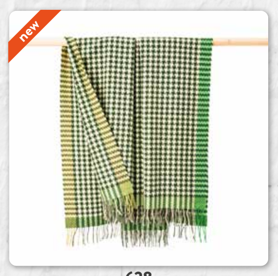
628 Cream Green Small Block