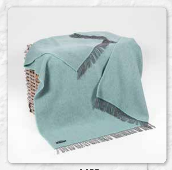
1423 Duck Egg Herringbone