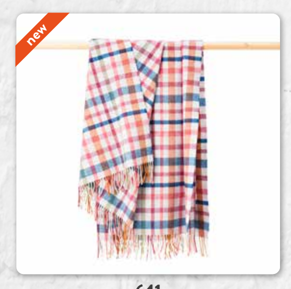
641 Grey Peach Rust Blue Green Check