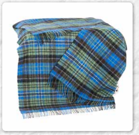
LW119 Royal Blue Lichen Plaid