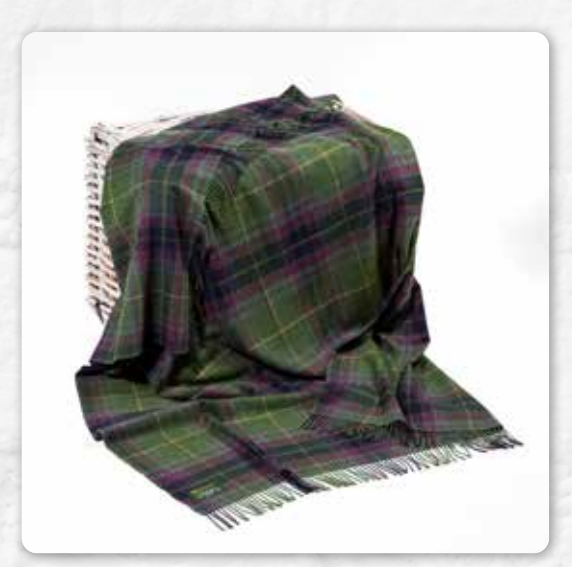
613 Green Navy Purple Plaid