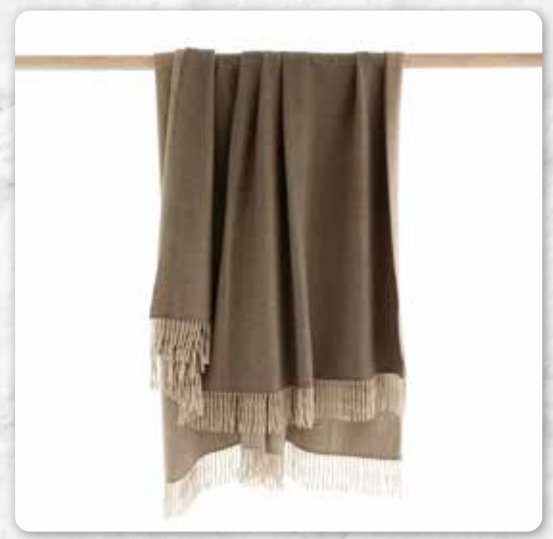
4003 Brown Beige