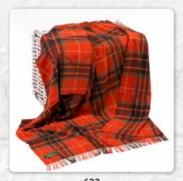
633 Orange Tartan Mix