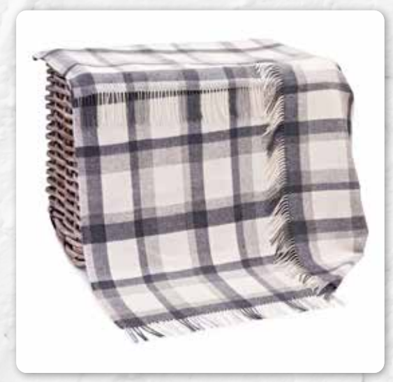
3151 Grey Ecru Plaid