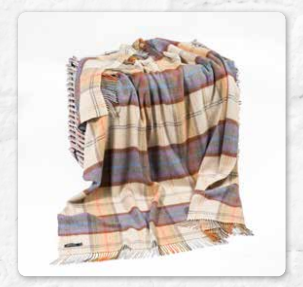
1458 Grey Mustard Plaid