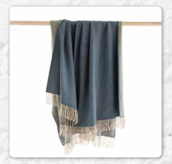
4005 Blue Beige