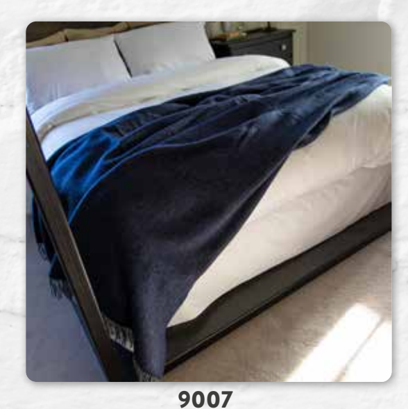
Dark Navy Herringbone