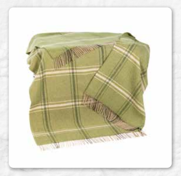
1467 Green Beige Cream Overcheck