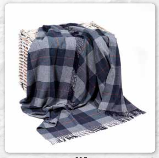
610 Navy Grey Glen Check