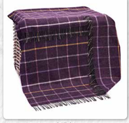
3156 Purple Windowpane