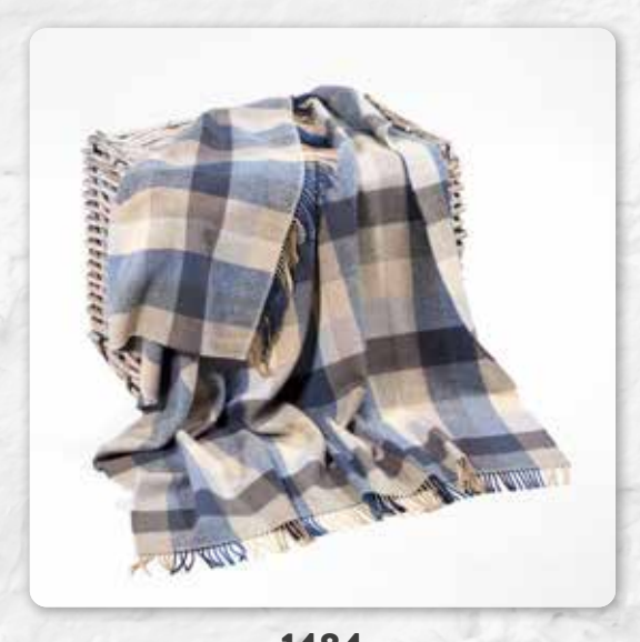
1484 Denim & Cream Grey Small Block Check