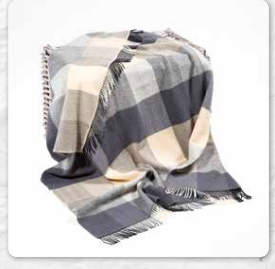
1485 Cream Grey Large Block Herringbone