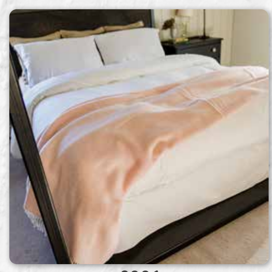
Baby Pink Herringbone