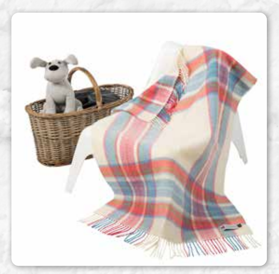
BB14 White Pink Blue Border Check