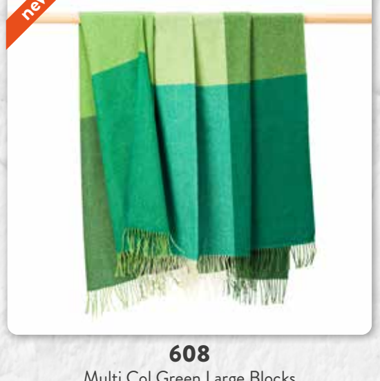
Multi Col Green Large Blocks