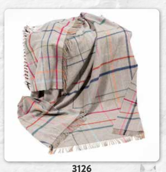
Grey with Multi Colour Window Pane