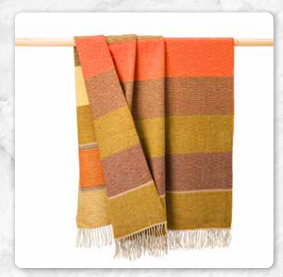
1402 Orange Yellow Brown Mustard Stripe