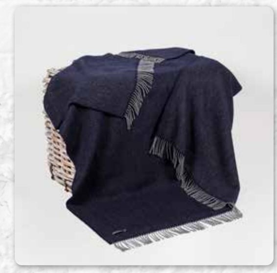
1408 Dark Navy Herringbone