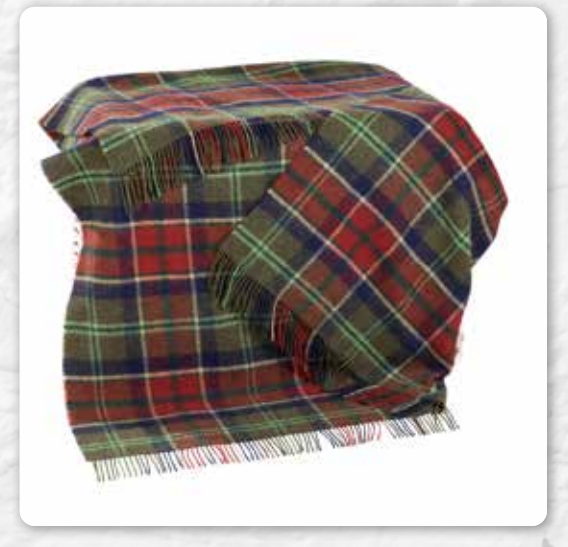
LW116 Loden Navy Claret Plaid