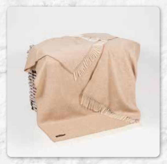
1475 Beige Herringbone