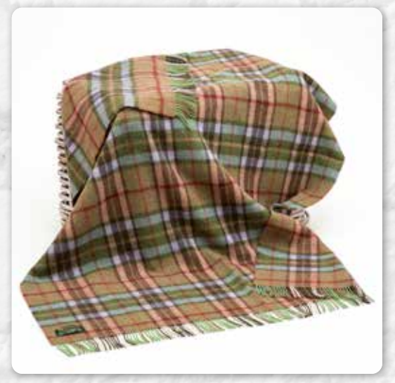
LW186 Pale Green Beige Blue Plaid