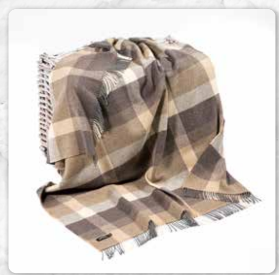
1413 Beige Cream Check