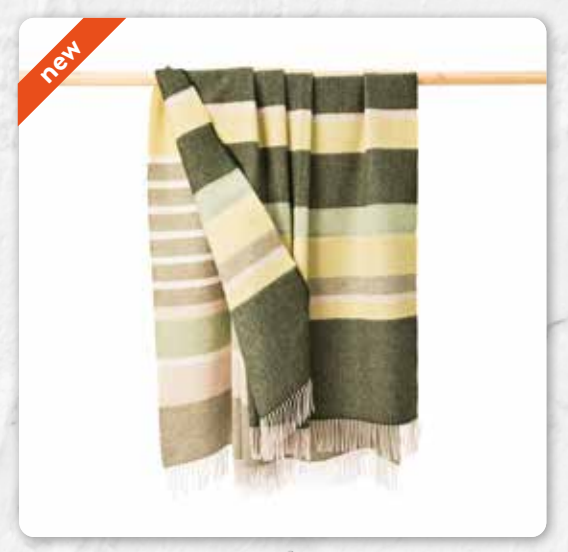
3160 Green Stripe