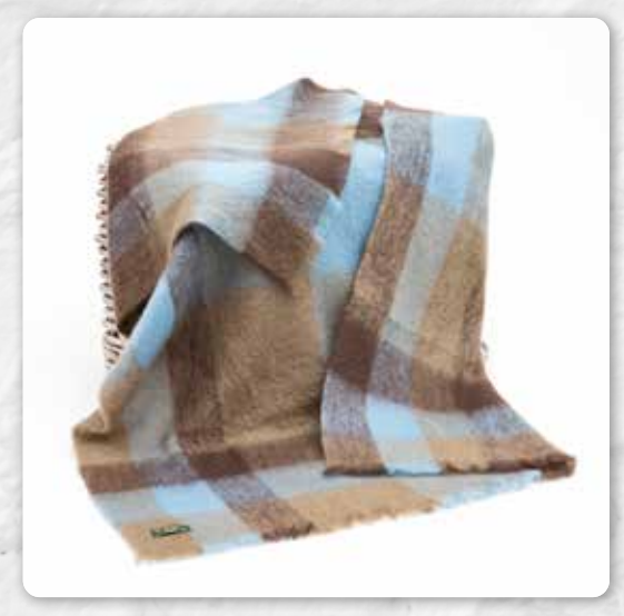
LM550 Taupe Sky Blue and Brown Check