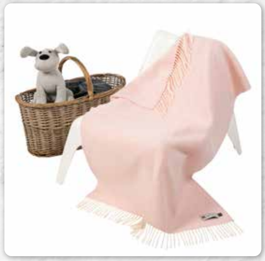
BB17 Baby Pink