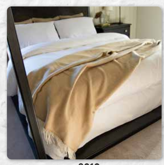
9010 Beige Herringbone