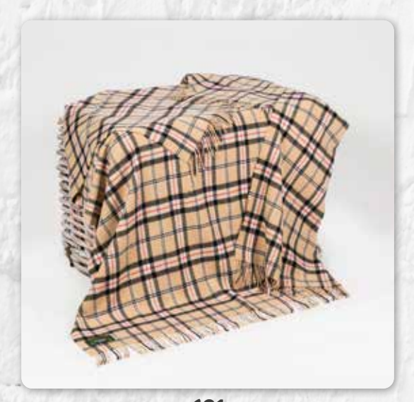
621 Camel of Merrick Tartan