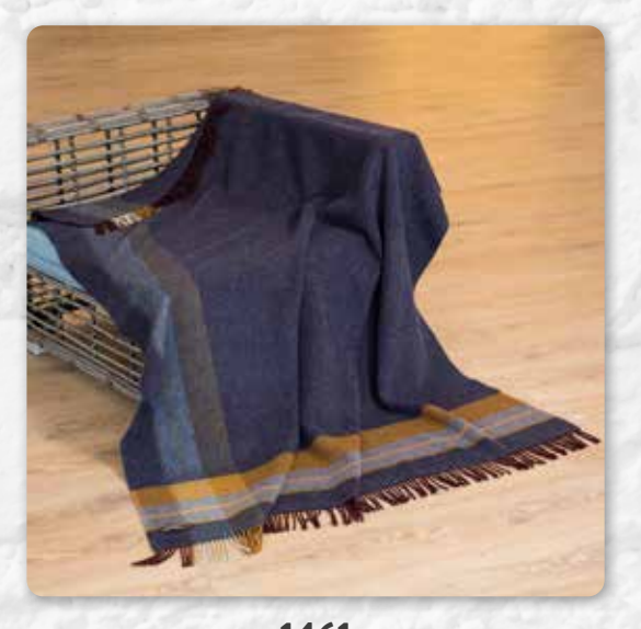
1461 Navy & Mustard Asymmetrical