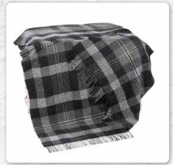
LW123 Grey Graphite Plaid