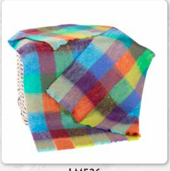
LM536 Purple Green Poppy Block