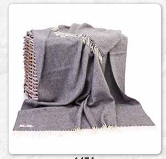
1474 Grey Herringbone