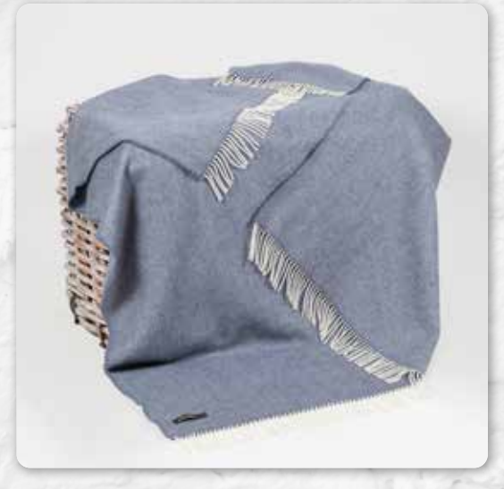
1476 Denim Cream Herringbone