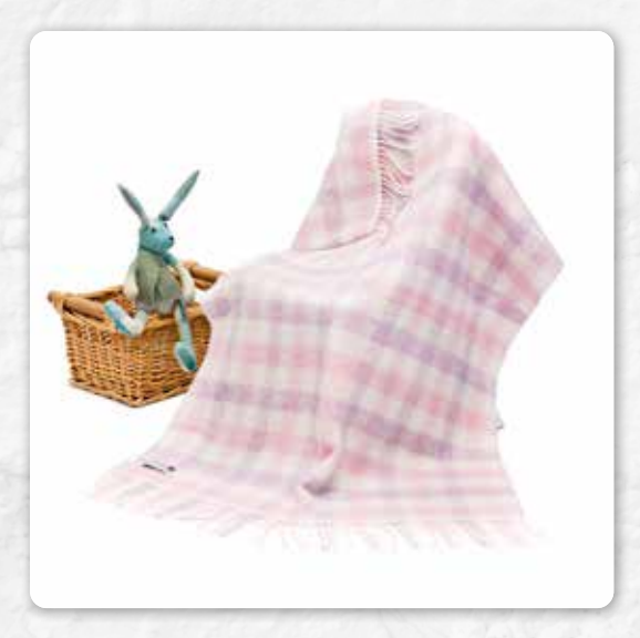
BB20 Baby Pink Lilac Block Check