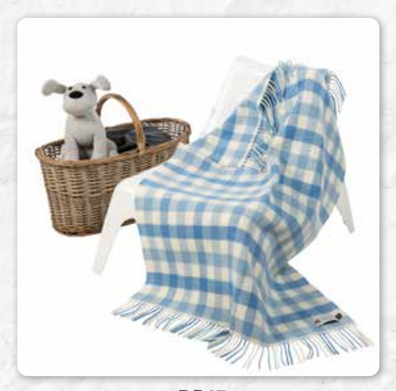
BB15 Blue Block Check