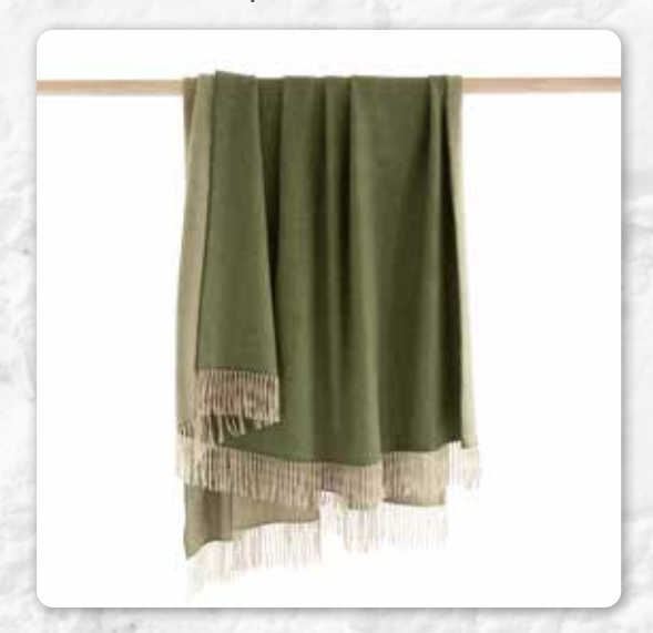
4002 Green Beige

Wool Angorra Throw 75% SuperfineWool, 25% Caregora Angorra - 136 x 190cms (54" x 71")