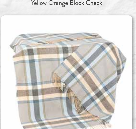
635 Sky Beige Grey Guard Check