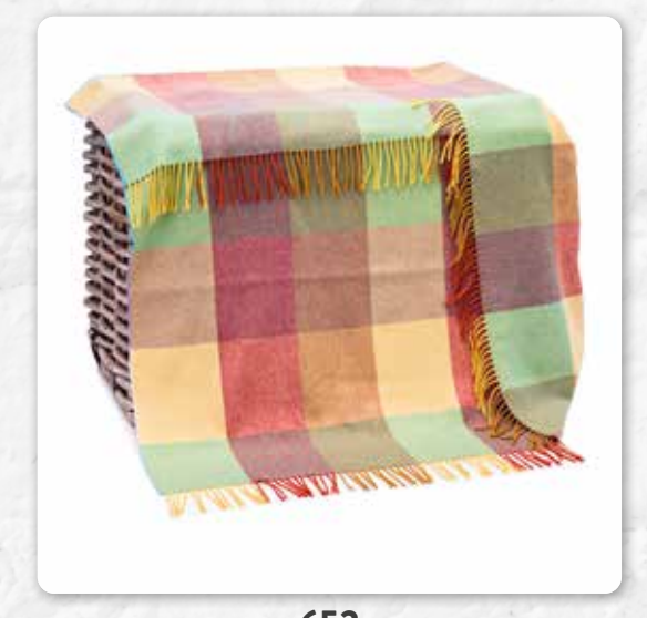
652 Yellow Green Beige Block Check