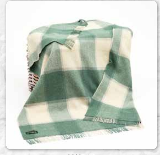
LW164 White Sea Green Black