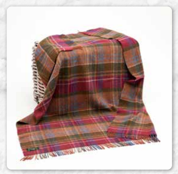
LW152 Raspberry Purple Green and Orange Plaid