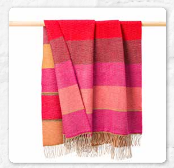
1401 Red Pink Biscuit Stripe