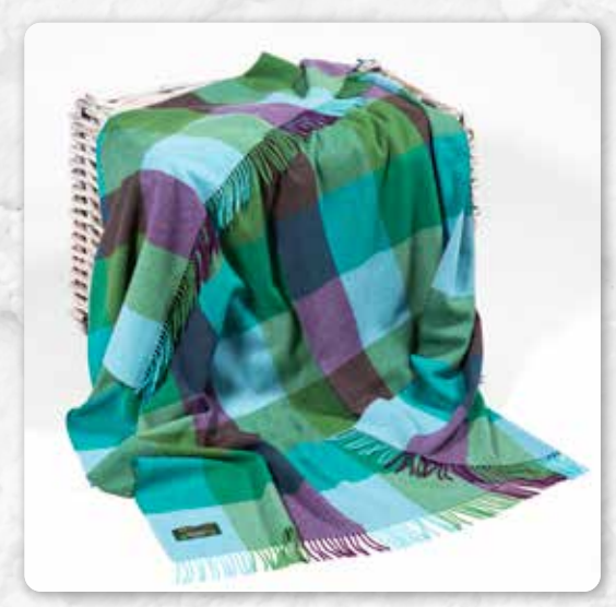
646 Green Blue Marine Block Check