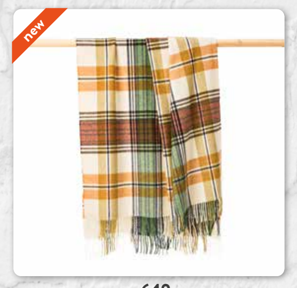
649 Cream Rust Mustard Green Plaid