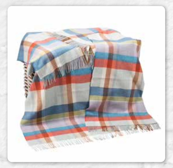
3131 Blue Green Lilac Peach Plaid