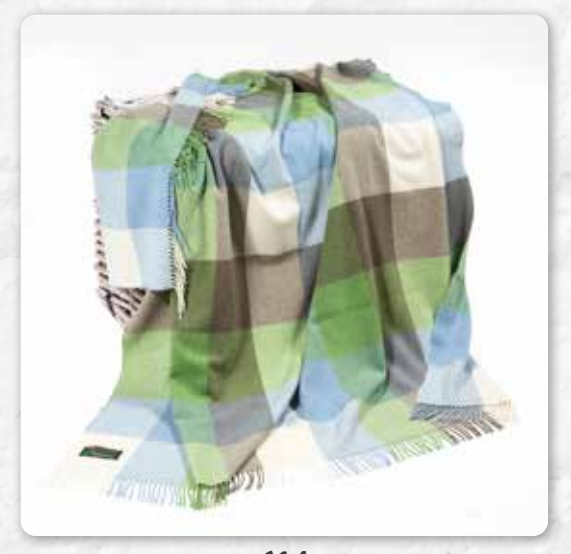
614 Cream Baby Blue and Green Block Check