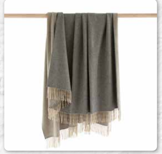
4004 Grey Beige