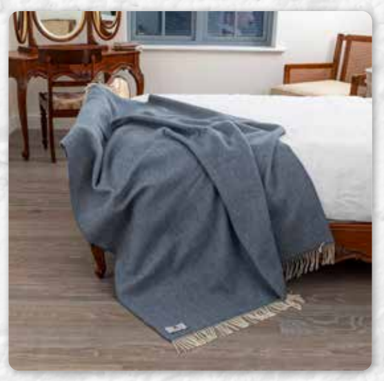
9005 Denim Cream Herringbone