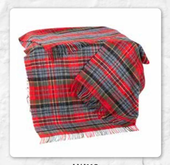
LW118 Scarlet Denim Plaid