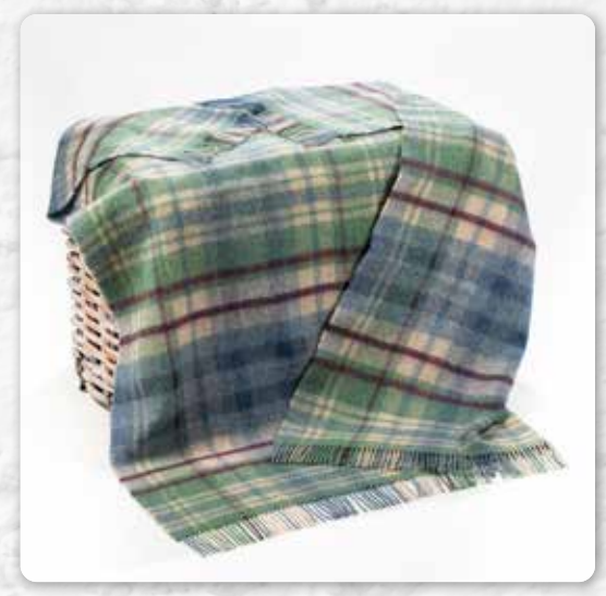
LW100 Denim Green Camel Burgundy Plaid