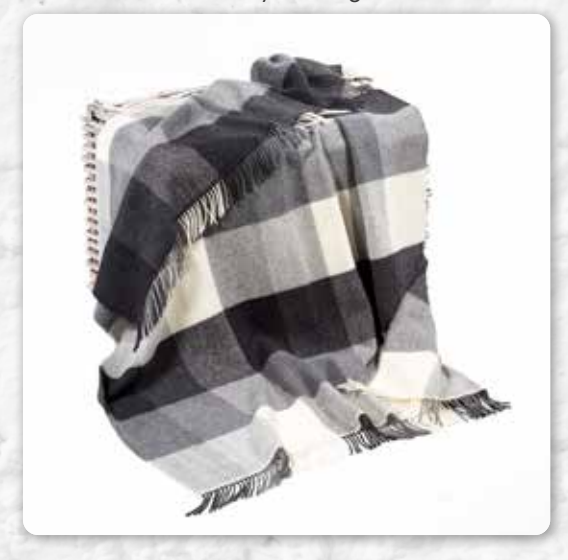
1486 White Grey Herringbone Block Check