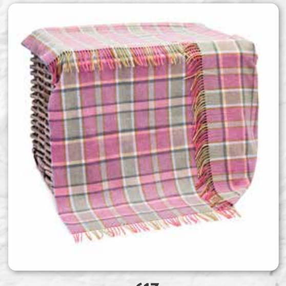
617 Soft Pink Green Check