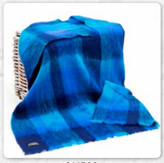
LM503 Navy Blue Aqua Block