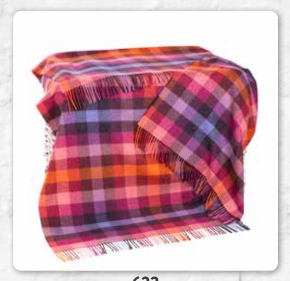
622 Pink Peony Viola Orange Multi Check