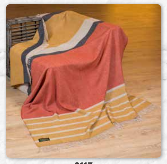
3117 Mustard Orange and Charcoal Stripe