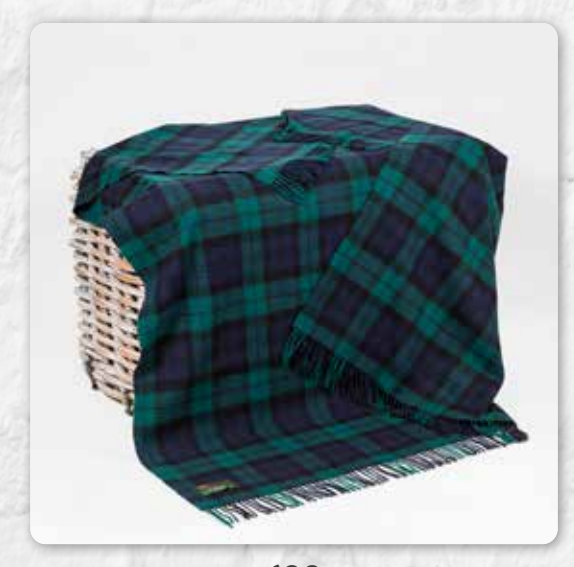
620 Black Watch Tartan