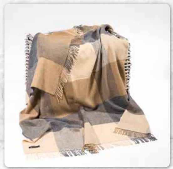
1473 Cream Charcoal Large Block