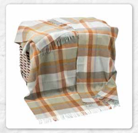
3140 Green Rust Mustard Plaid