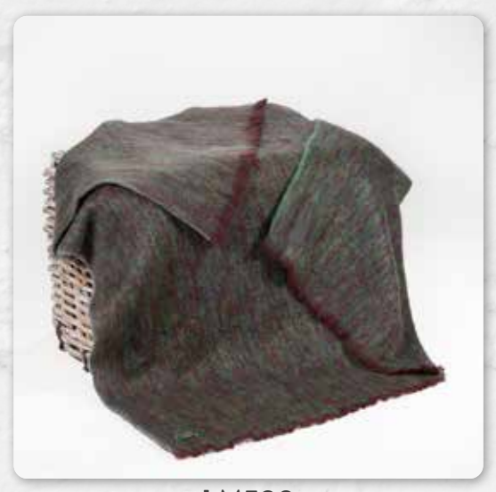
LM520 Dark Purple and Green Plain