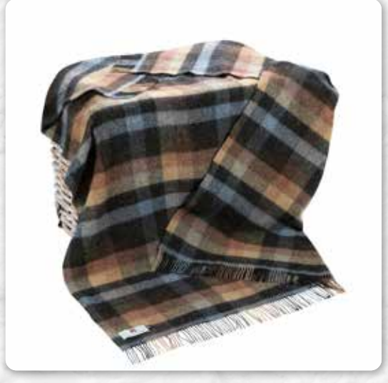
LW127 Brown Charcoal Grey Rust Box Plaid