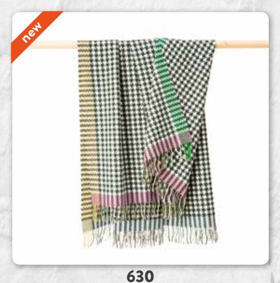
Cream Green Blue Small Block