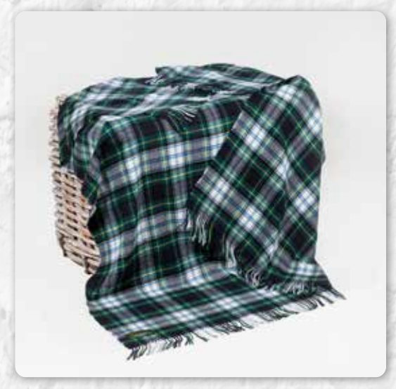
606 Dress Gordon Tartan