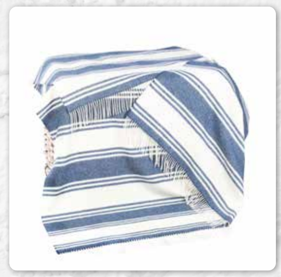
3150 Blue & White Stripe