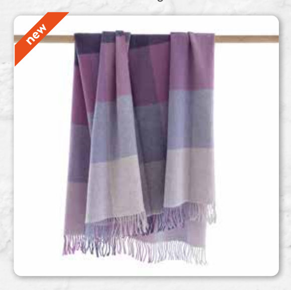
1442 Purple Lavender Lilac Blocks