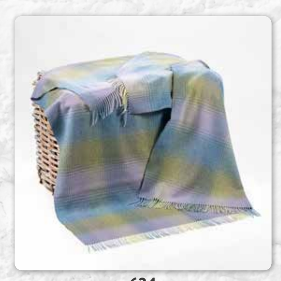
634 Blue Green Lilac Herringbone Check