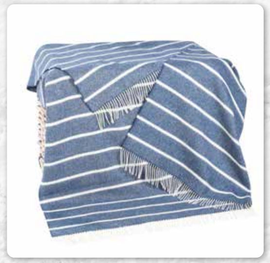
3149 Denim White Horizontal Stripe