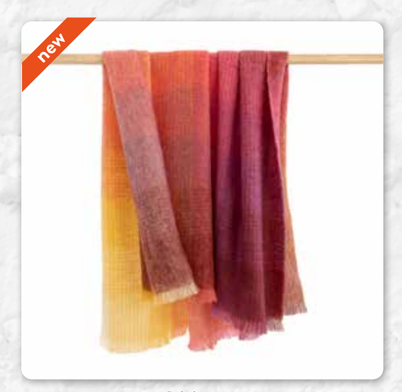
LM509 Pink Yellow Purple Multi Mix