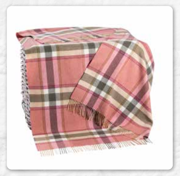
651 Pink Beige Loden Guard Check