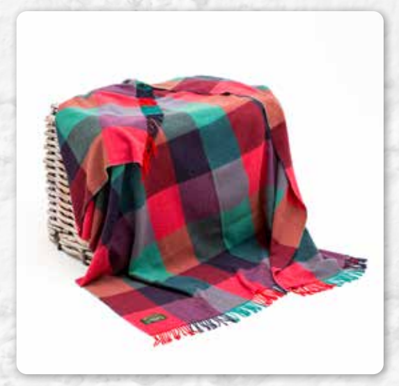
619 Bright Pink, Purple and Teal Block Check