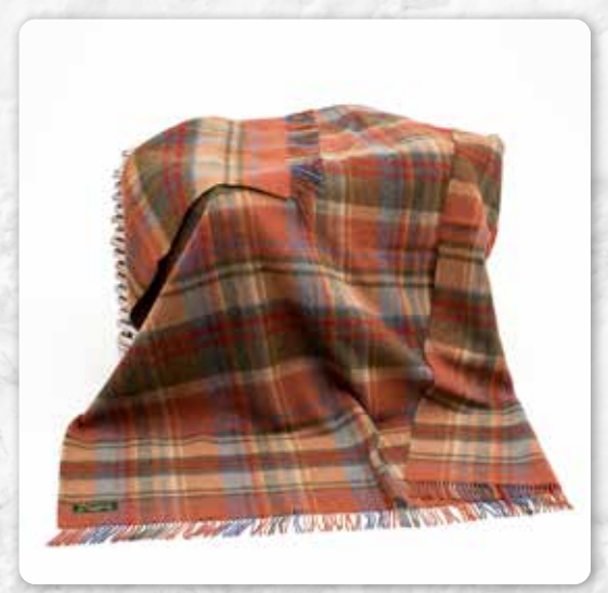
LW153 Brown Orange and Blue Plaid