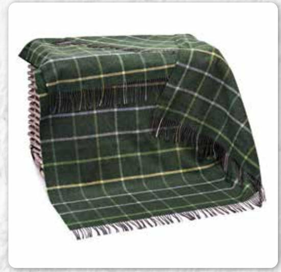
3155 Green Windowpane