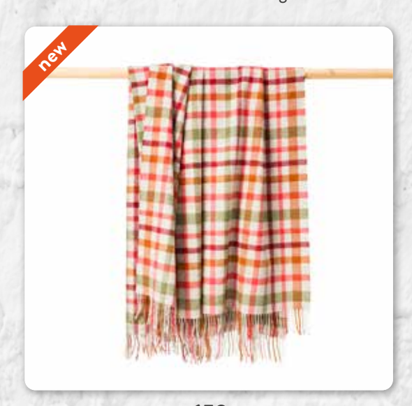
653 Beige Green Rust Maroon Check