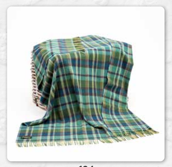
624 Green Mix with Blue Tartan