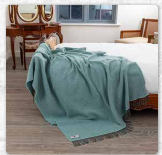
9003 Duck Egg Herringbone