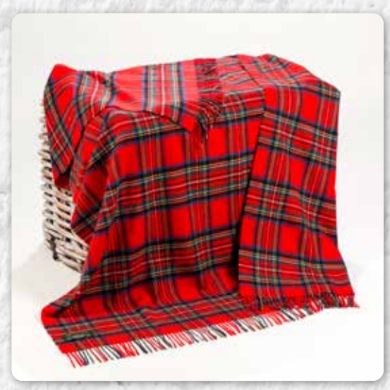
644 Royal Stewart Tartan