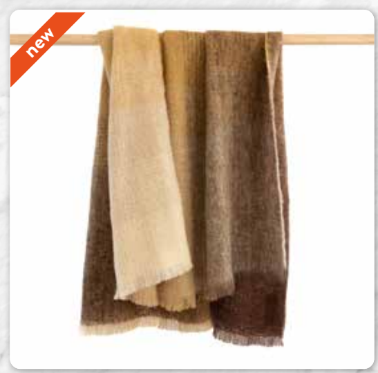
LM508 Brown Tan Beige Mix