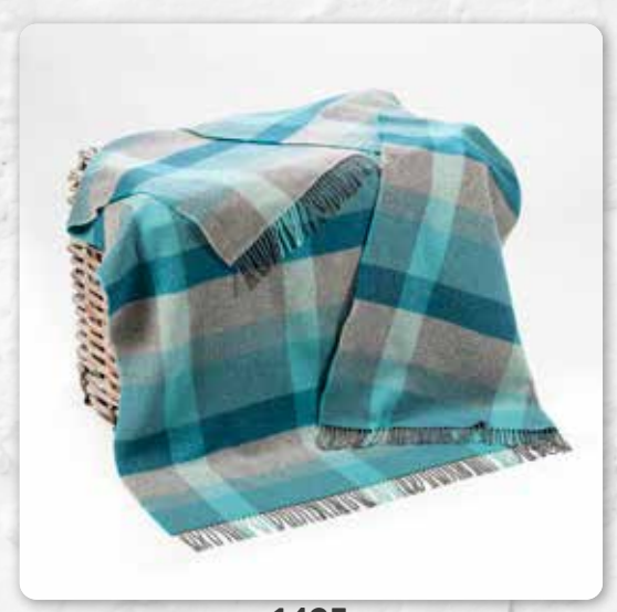
1435 Grey Duck Egg Aqua Teal Check