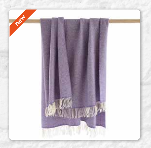
1440 Lavender Purple Herringbone