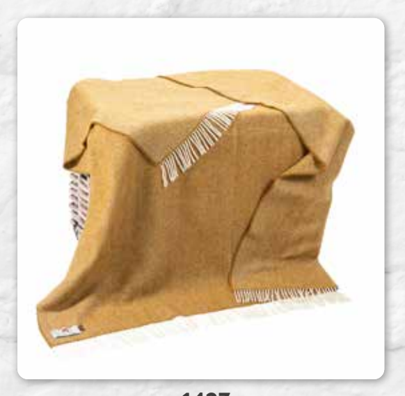
1427 Mustard Mix Herringbone