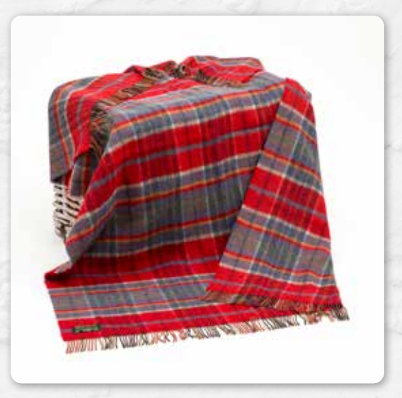
LW180 Orange Red Midnight Blue Plaid