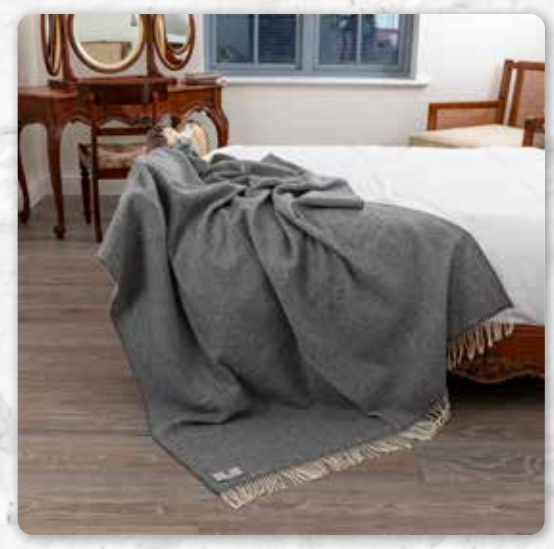
9000 Grey Herringbone