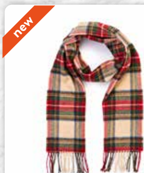
501 Antique Dress Stewart