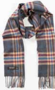
151 Charcoal Beige Maroon Check