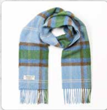
280 Light Blue Green Check