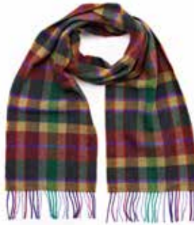
1985 Mustard Green Rust Check