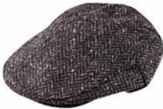
TC D20 Charcoal Black Herringbone Donegal