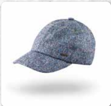
BC H84 Grey Denim Herringbone