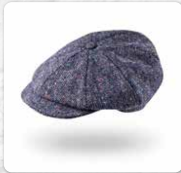
8 PC H30 Navy Plain Donegal