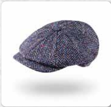
8 PC H27 Navy Herringbone Donegal

This eight piece cap made famous in Peaky Blinders is the classic Newsboy Cap also known as the Gatsby Cap.