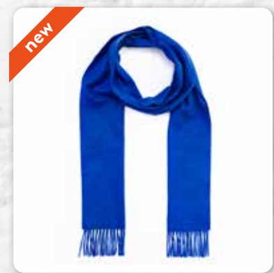
475 Royal Blue