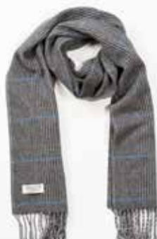
533 Light Grey Charcoal Stripe