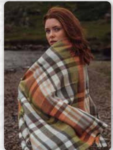
752 White Orange Green Plaid