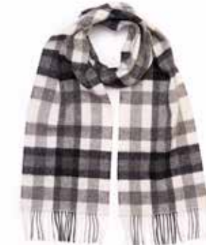
1907 Snow Grey Charcoal Grey Check