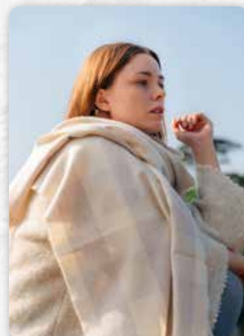
762 Light Cream Checker