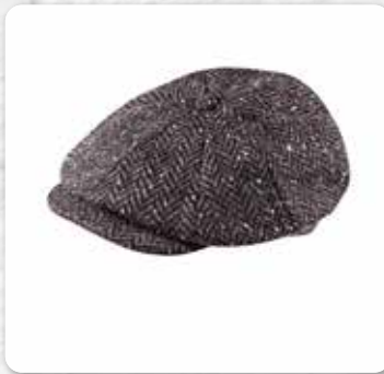
8 PC D20 Charcoal Black Herringbone Donegal