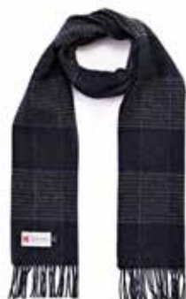
565 Charcoal Indigo Glencheck