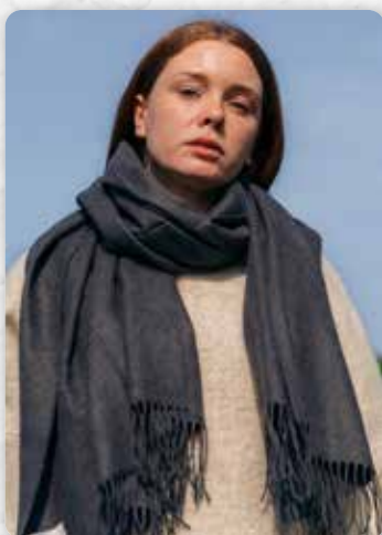
784 Solid Charcoal