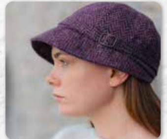
Eve D Pink Deep Purple Herringbone Donegal