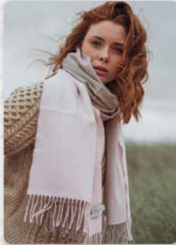
781 Baby Pink Glencheck