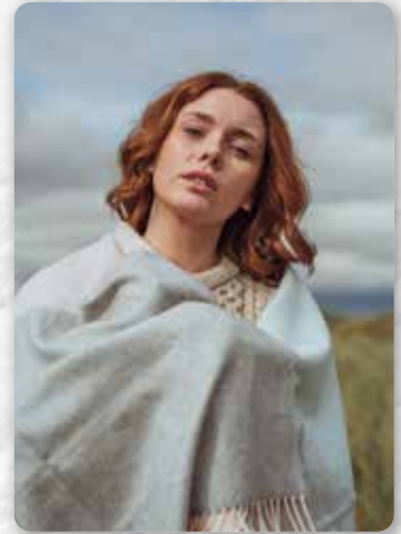
771 White Pink Blue Stripe