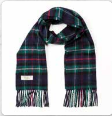
222 Mackenzie Tartan