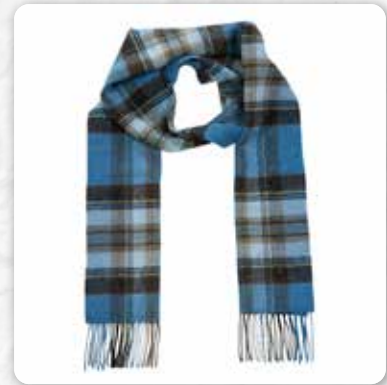
205 Blue Royal Sage Plaid