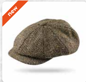
8 PC H14 Brown Green Donegal Herringbone