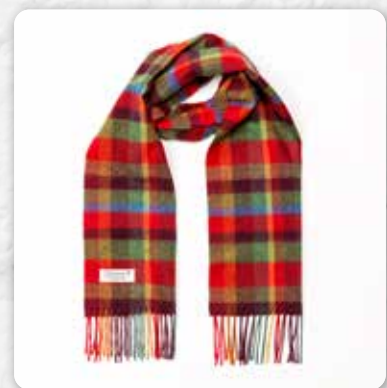
211 Red Green Yellow Check