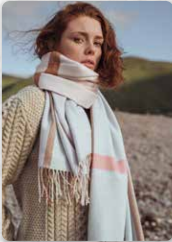
780 Baby Blue Pink Mix Check