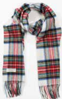
549 Dress Stewart Tartan