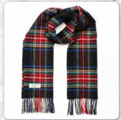
221 Black Stewart Tartan