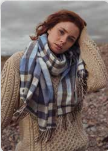
751 Natural Skyblue Cornflower