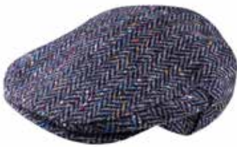
TC H27 Denim Navy Herringbone Donegal