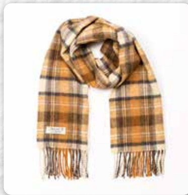
291 Beige Orange Check