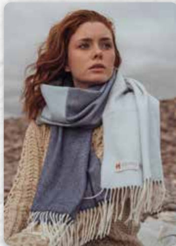
772 White Denim Navy Stripe