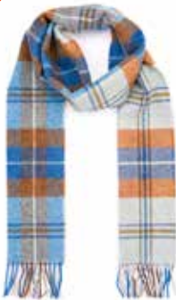
1990 Blue Grey Rust Plaid