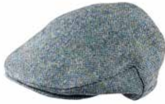
TC H74 Mid Blue Green Herringbone