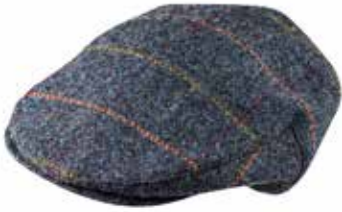
TC H57 Charcoal Denim