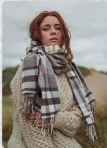
750 Natural Grey Brown Plaid