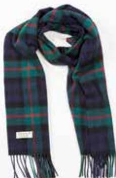
502 Navy, Red and Bottle Green Check