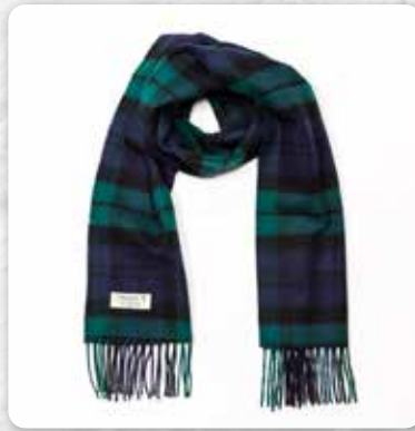
245 Black Watch Tartan