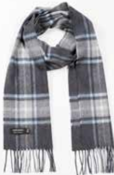
193 Charcoal Grey Blue Plaid