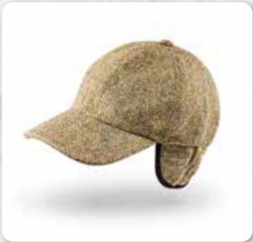
BC J5 Beige Green Herringbone