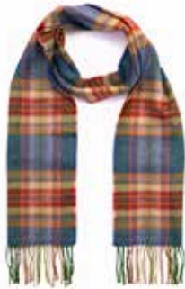
107 Sea Green Rust Plaid