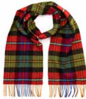
1987 Red Black Green Plaid