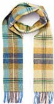
1991 Citrus Blue Brown Plaid