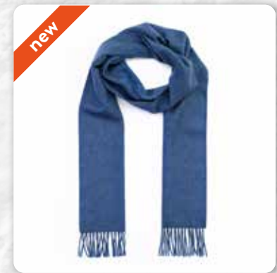
472 Denim Blue