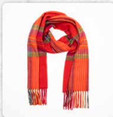
207 Red Orange Plaid