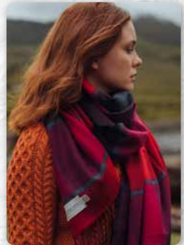
776 Navy Red Purple Block