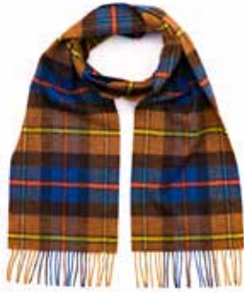
1988 Brown Blue Rust Plaid