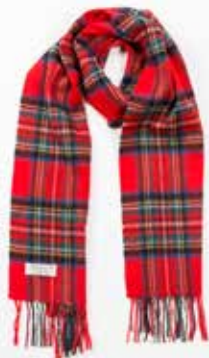
550 Red Royal Stewart Tartan