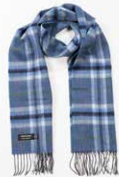
189 Denim Grey Plaid