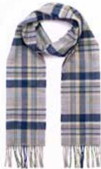
166 Grey Blue Check