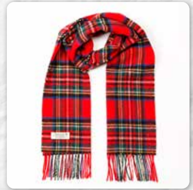
244 Red Royal Stewart Tartan