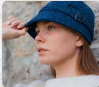
Eve B Royal Blue Navy Herringbone Donegal