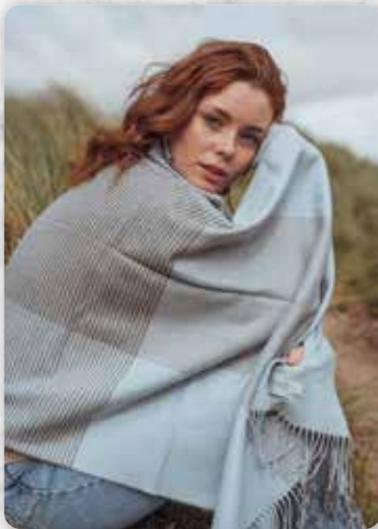
782 Baby Blue Glencheck