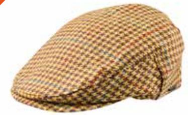
TC H37 Brown Beige Houndstooth