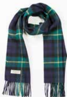
504 New Green and Yellow Tartan