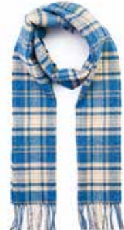
1992 Blue Beige Check