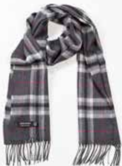
188 Charcoal Grey Plaid