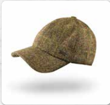
BC H65 Loden Rust