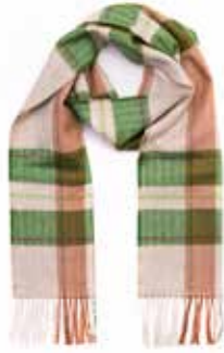
181 Green Rust Check