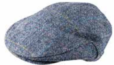
TC H84 Grey Denim Herringbone