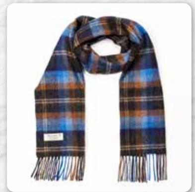
241 Blue and Orange Mix Check