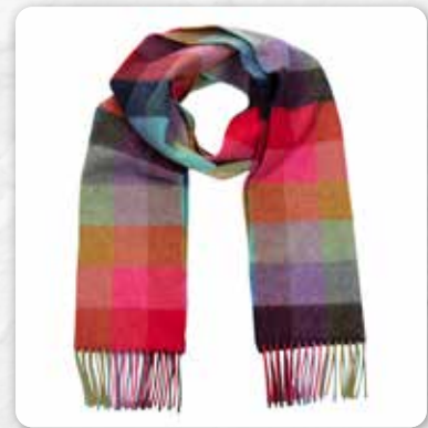
248 Navy Blue Jade Bronze Block