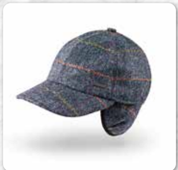
BC H57 Charcoal Denim