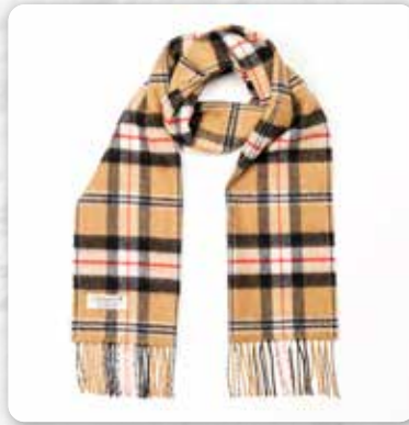
202 Camel of Merrick Tartan