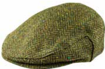
TC H15 Moss Green Donegal Herringbone