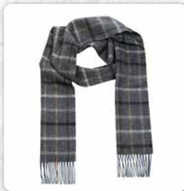
239 Denim Beige Blue Black Overcheck