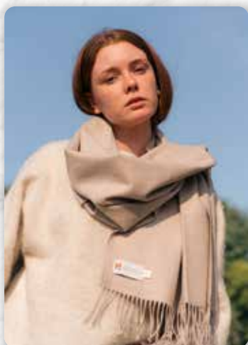
783 Solid Sand