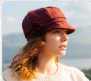
Una C Red Deep Purple Herringbone Donegal