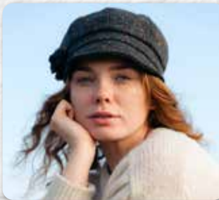
Una A Brown Turquoise Herringbone Donegal

(Ladies Hats are available in sizes – S/55/6 3 / 4 , M/57/7 & L/59/7 1 / 4 )