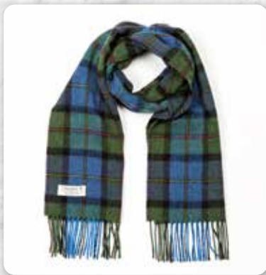
223 Denim Green Check