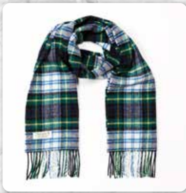
203 Dress Gordon Tartan