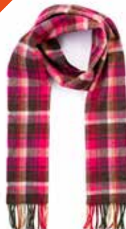
1914 Pink Maroon Check