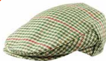
TC H35 Green Beige Houndstooth