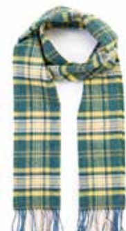
1995 Yellow Green Mix Check