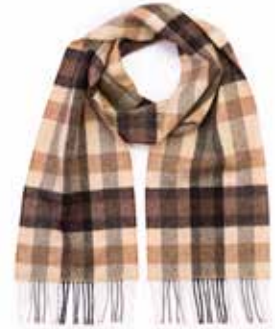
1927 Cream Brown Chocolate Check