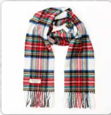
204 Dress Stewart Tartan