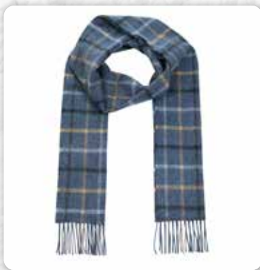
237 Grey Beige Blue Black Overcheck