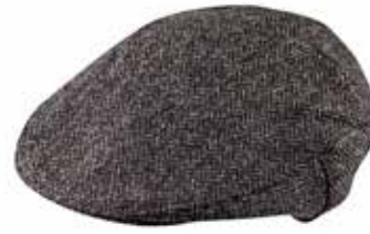
TC D41 Charcoal Black Herringbone