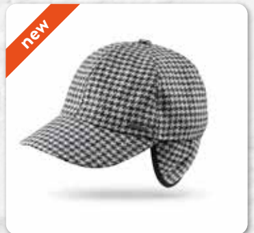
BC H57 Black & White Houndstooth