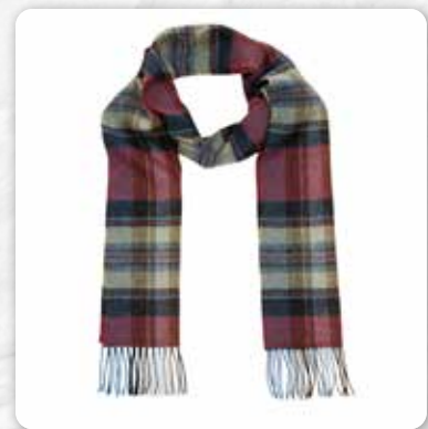
230 Red Straw Graphite Plaid