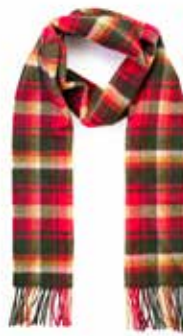
1902 Red Green Check