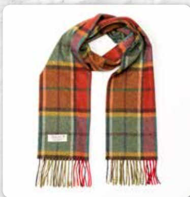
231 Autumnal Mix Check