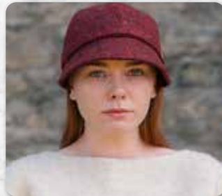
Eve C Red Deep Purple Herringbone Donegal