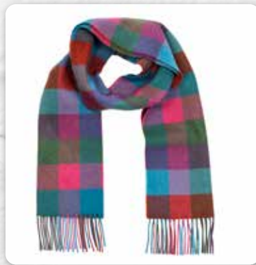
249 Tabasco Blue Purple Green Block