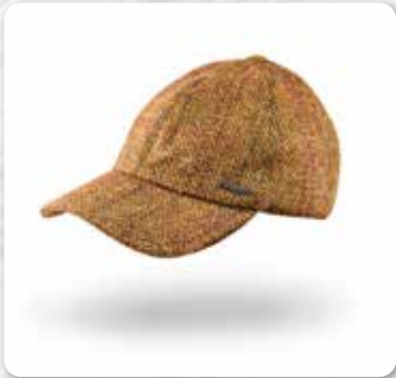
BC H56 Tan Brown Herringbone