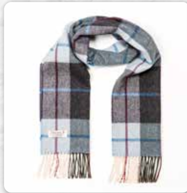
212 Light Blue Charcoal Check