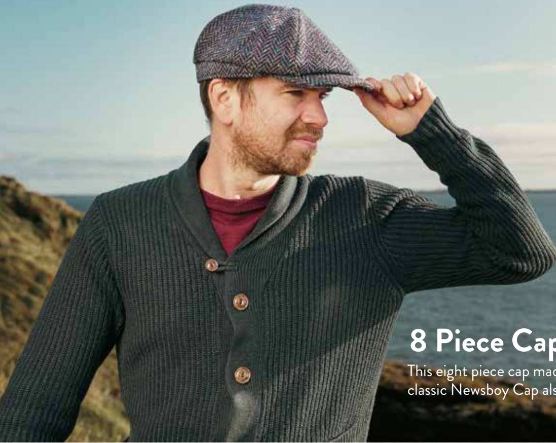
Hat Size Table