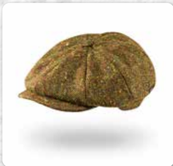
8 PC H36 Green Brown Donegal