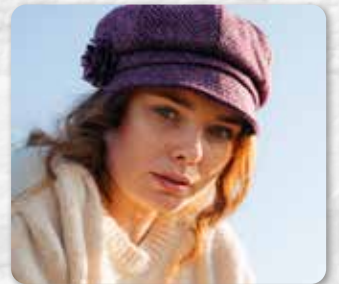
Una D Pink Deep Purple Herringbone Donegal