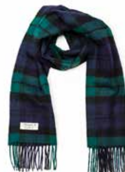
526 Black Watch Tartan