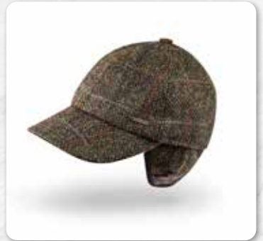
BC H58 Dark Green Black Herringbone