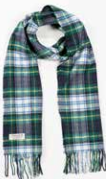
551 Dress Gordan