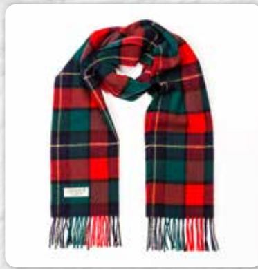
217 Kilgore Tartan