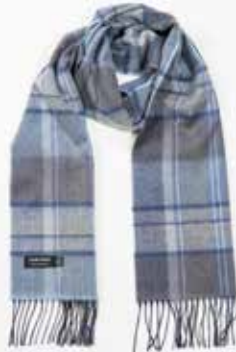
187 Grey Blue Check