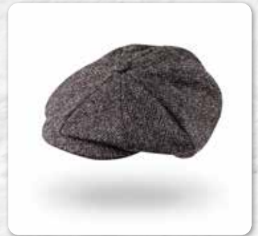
8 PC D41 Charcoal Black Herringbone