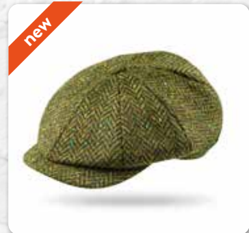
8 PC H15 Moss Green Donegal Herringbone