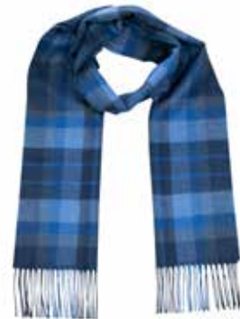
195 Blue Navy Plaid