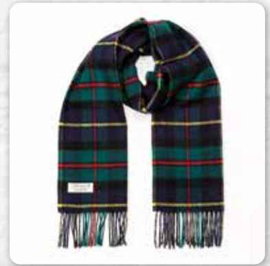
200 Hunting Mcleod