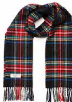
578 Black Stewart