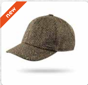
BC H14 Brown Green Donegal Herringbone