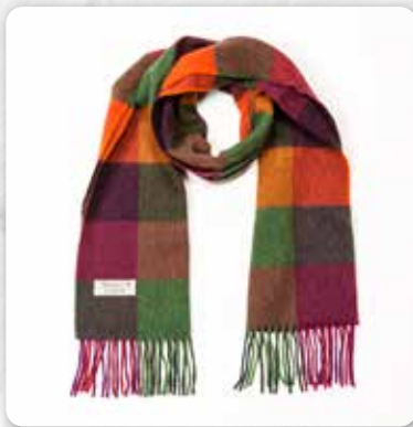
247 Maroon Green Block Check