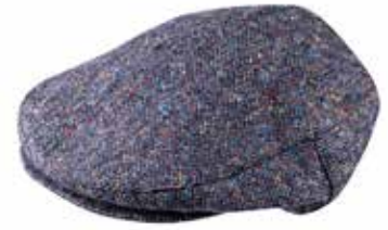
TC H30 Navy Plain Donegal