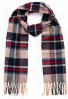
132 Navy Red Biscuit Check