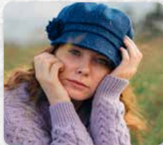
Una B Royal Blue Navy Herringbone Donegal