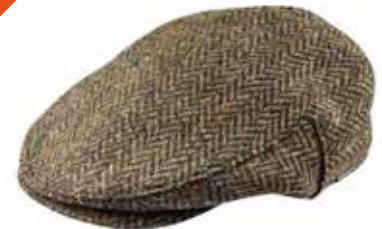
TC H14 Brown Green Donegal Herringbone