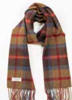
534 Rust Brown Red Plaid