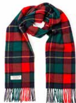
548 Kilgore Tartan