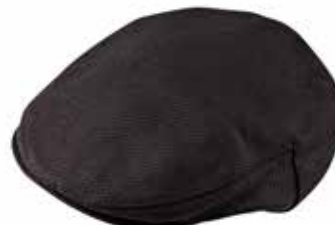
TC Black Black