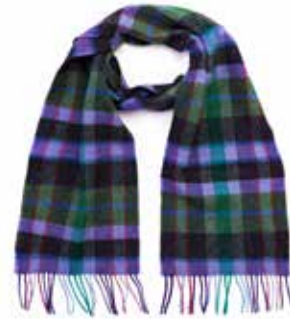
1986 Lavender Charcoal Green Check